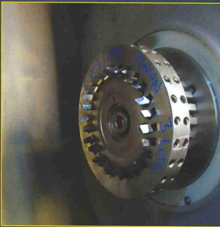
Getrag generates ring and pinion gears using solid carbide stick tools, which are reground and edge prepped in-house.

of carbide and various coatings, without achieving much improvement.